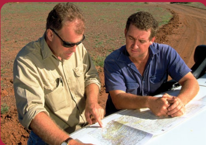
▲ Assess the likelihood of spray drift onto pastures or feed crops.

Metarhizium anisopliae is registered for the biological control of locusts and grasshoppers. The grazing withholding period (WHP) is 0 days. There is no risk of residues in livestock associated with use of products containing metarhizium.