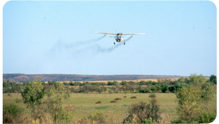
▲ Control spraying can result in drift.

Producers who have observed Export Intervals are encouraged to make a statement to this effect, in the Additional Information section.